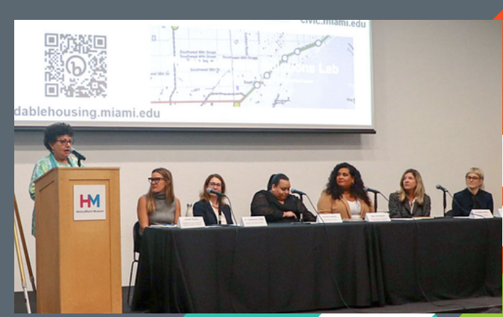
CAMP Launch Panel Discussion History Miami Museum, December 2022