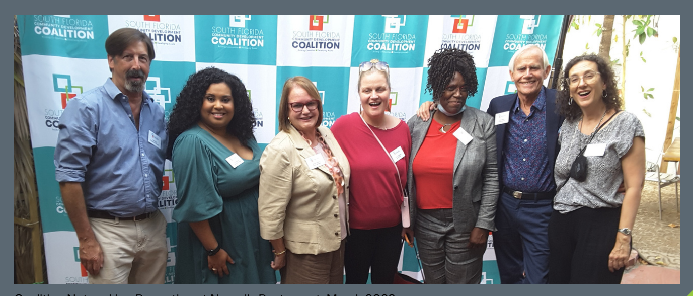
Coalition Networking Reception at Naomi's Restaurant, March 2022

South Florida Community Development Coalition, Inc. (SFCDC), established in 2007, is a 501c3 member-led organization dedicated to building communities and developing assets in South Florida. We achieve these goals by expanding the capacity of community development practitioners, facilitating public policy research and advocacy, and fostering collective impact for systems change . Our members include developers, nonprofits, financiers, practitioners, and advocates, among others who work to provide low-to-moderate income people with greater access to the tools necessary to build wealth and ensure all neighborhoods are livable, safe, and economically vibrant.