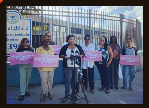
Local Media Press Conference Allapattah, September 2022

PLPG continued advocating on behalf of the proposed redevelopment of the General Service Administration (GSA) site, a nearly 18-acre lot of land owned by the City of Miami located in Allapattah. We held more than a dozen virtual and in-person meetings and interactions with officials administrators elected and intervene on the Request for Proposals (RFP) process by offering criteria and advocated for a new resolution, including Community Benefits Agreement (CBA) requirements. These efforts remain on-going. The Working Group will work with Liberation in a Generation to refine the collective impact strategy and advocacv campaigns in 2023.